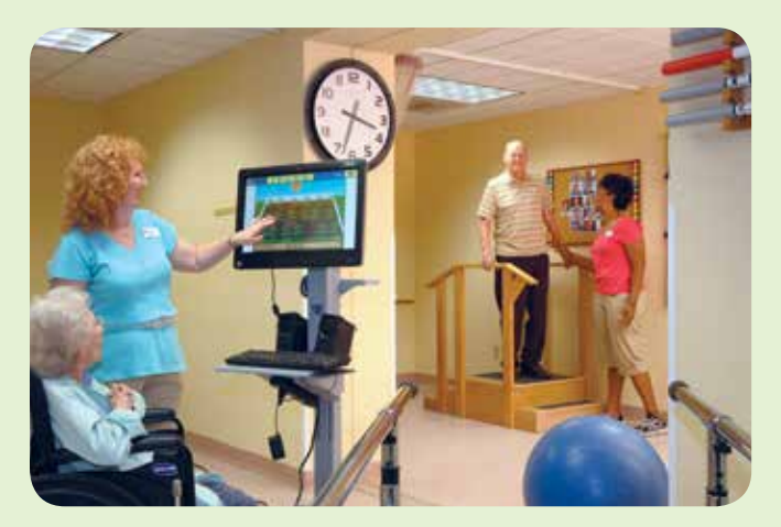
Residents focus on Touch Screen iN2L assistive technology, which enhances cognitive function, memory and lifelong learning; and physical therapy at Collingswood Manor.

A few examples include daily exercise group, nutritional health programs; physical, occupational and speech therapies; psychiatric and podiatry services; and educational in-services on topics like diabetes, cold and flu prevention; socialization; group activities; and many more."