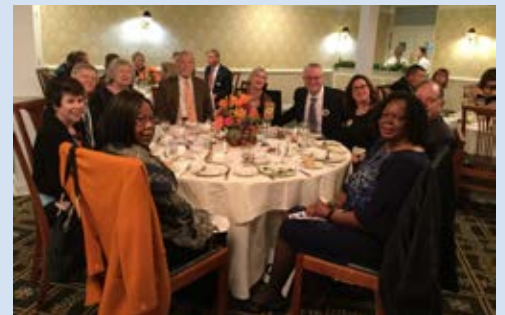
Members of the United Methodist Communities Board of Directors and United Methodist Communities Foundation Board of Trustees celebrate Bristol Glen.

Everyone who helped make the event a success were truly living the words of John Wesley when he famously stated "Do all the good you can, by all the means you can".